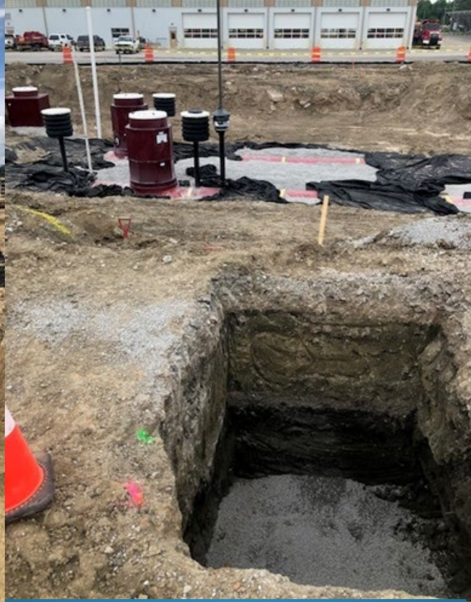
June 24 th Tanks covered and dug hole for footings