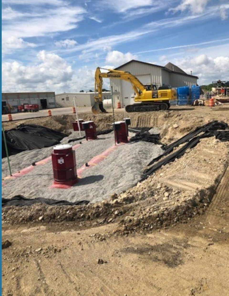
June 21 st Covering Fuel Tanks